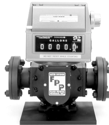
5201.0150.VR2 Representative Model